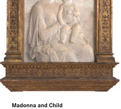
Madonna and Child Antonio Rossellino | around 1460 Arp Museum Bahnhof Rolandseck / Rau Collection for UNICEF