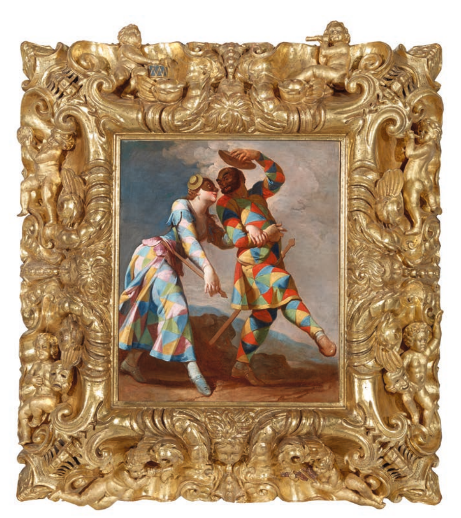
Harlequin and his Lady | Giovanni Domenico Ferretti | 18th century

Still Life with Fish, Fruit and Flowers | Giuseppe Recco | 2nd half of the 17th century Arp Museum Bahnhof Rolandseck / Rau Collection for UNICEF Photo: Horst Bernhard