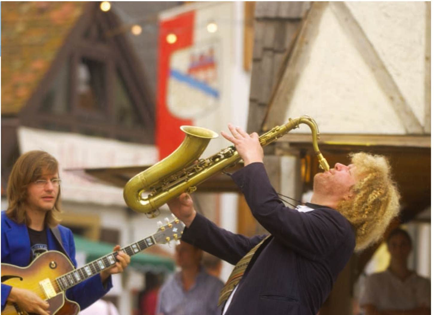
Old Town Celebration/Altstadtfest

For an atmosphere that is full of life, be sure to come to Speyer's Old Town Festival (Altstadtfest) in September. Presented by Speyer's clubs and associations, it has developed a very special charm of its own over the years. Everyone comes to chat with old friends and meet new ones in the twisting side streets and inviting interior courtyards of Old Town. Vacationers who find themselves in the midst of it all are sure to feel welcome too. The carefree atmosphere is, quite simply, contagious.