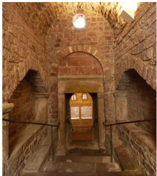
Jewish Courtyard with Mikva/Judenhof mit Mikwe

At No. 10 Kleine Pfaffengasse, the extended western wing of the one-time prince's residence begins. In 1847 and the years thereafter, it was renovated, ex-