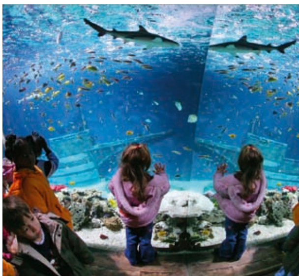
Aquarium SEA LIFE Speyer/Großaquarium SEA LIFE Speyer

In the Cathedral Garden we will walk further toward the east, cross Schillerweg, and after crossing the Speyerbach, reach another attraction, the giant aquarium known as SEA LIFE Speyer . This attraction