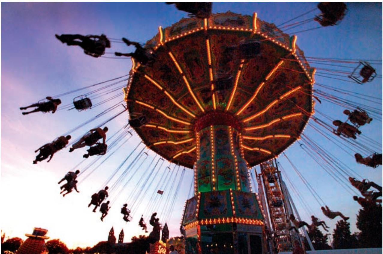
Pretzel Festival/Speyerer Brezelfast

building called Wilhelmsbau with its mechanical musical instruments – all this will fascinate you in the TECHNIK MUSEUM SPEYER. The main attraction since October 2008 is an original russian “BURAN” Space Shuttle together with Europe’s biggest space exhibition. It is open at all times of the year. There is one more “winner” to be enjoyed by young and old at the Museum: the IMAX dome film theater presents the world to visitors from unusual perspectives. The sensational productions are so realistic that the viewer feels as though he is a part of every scene.