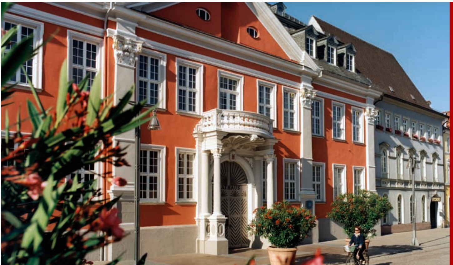
The Historic City Hall/Historisches Rathaus

An independent city in the Rhine-Neckar region since 1946, the Speyer of today is a competitive urban resource center with over 50,000 residents. Just under 22,000 are able to earn their living in the city. A major portion of these jobs range from the customer service sector across the spectrum to the Speyer University for Public Administration , the only postgraduate training center for the upper ranks of civil servants in Germany.