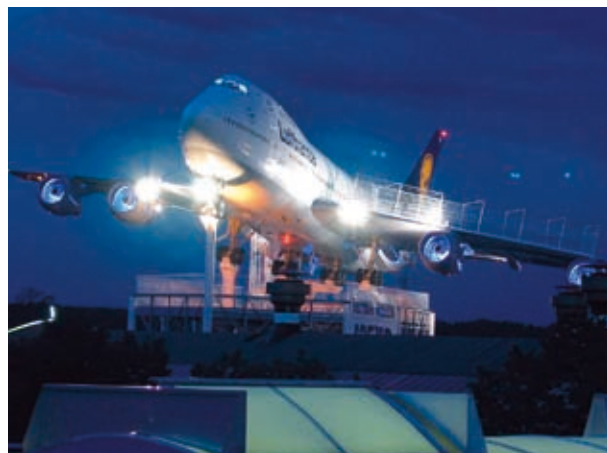
Technology Museum Speyer/Technik Museum Speyer

invites you to take an underwater journey along the Rhine, through the North Sea, into the depths of the Atlantic Ocean and further to the colourful tropic world of sharks and schooling fish. Over 3,000 fish from over 100 species in more than 30 naturally decorated tanks show species including seahorse, star fish, rays and sharks. Information about the environment and water pollution as well as yearly changing SOS action contributes to a better understanding of conservation. Through interactive games, films, and trained personnel, your trip through the underwater world becomes an informative, exciting and entertaining experience for young and old alike.