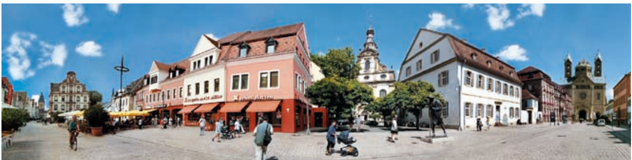
View of the City of Speyer/Stadtansicht

Celts, Roman soldiers, wars and revolutions, ecclesiastical and secular rulers, and above all, the will of its citizens have shaped the face of the city. Already determined to have been a settlement during Celtic times, the first Roman military camp came into existence in the year 10 B.C. between what are today the Bishop's Residence and City Hall. The civilian settlement that developed, first called "Noviomagus" and then "Civitas Nemetum" grew, despite many setbacks, into a regional government and commercial center. In the 6th century, it was referred to as "Spira" in documents.