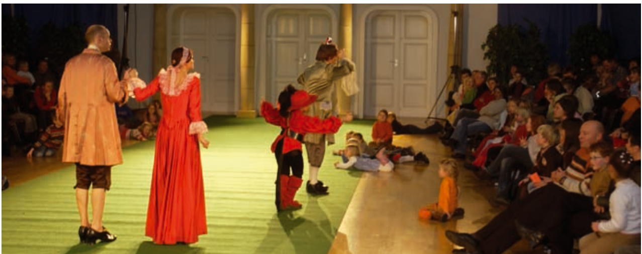
Theatre for Children and Young People Speyer/Kinder- und Jugendtheater Speyer

city. Regular exhibitions by local art associations and by the municipal gallery in the Kulturhof Flachgasse and the Künstlerhaus in the Sämergasse offer the art lover many interesting insights into the accomplishments of Speyer's painters and sculptors. The Kulturhof Flachgasse and the Künstlerhaus are located right next to the Skulpturengarten ; both are cared for by the Artists' League of Speyer. Under the motto, "Art in the Outdoors", more than 20 modern sculptures by male and female sculptors have been installed in recent years at various places in the city, including the Sculpture Garden. New contact opportunities and new possibilities for interaction between artists and the public have been highlighted, with the object of helping the public better understand art and artistic endeavor. Several other galleries contribute to this effort with rich exhibition programs of their own.