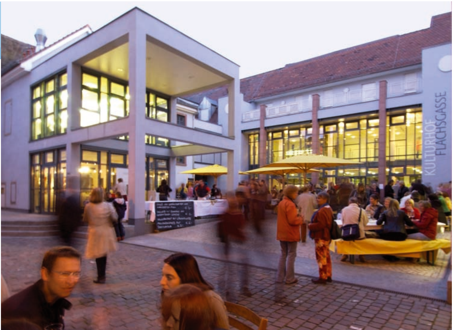
Cultural Courtyard/Kulturhof Flachsgasse

The life's work of two of the most revered artistic sons of Speyer: Anselm Feuerbach (1829 – 1880) and Hans Purrmann (1880 – 1966) are commemorated with permanent exhibitions in the houses in which they were born. Purrmann's name is also carried on the City of Speyer's Award for the Advancement of the Visual Arts, an honor recognized throughout Germany.