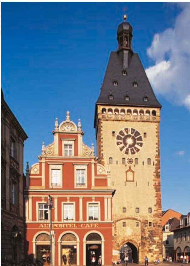
Old City Gate/Altpörtel/Stadttorturm Altpörtel

Once you have climbed the 154 steps to the gallery of the Altpörtel, you are rewarded with a marvelous