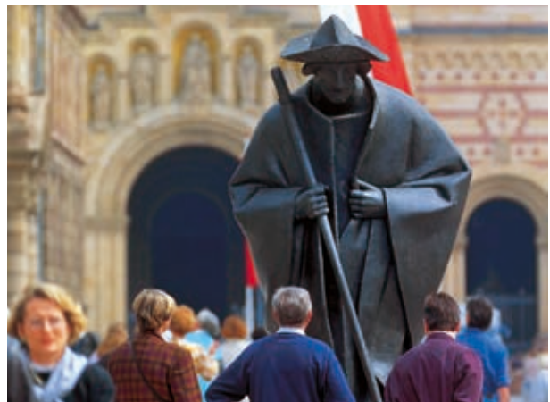
St. James Pilgrim/Jakobspilger

For 1,000 years, pilgrims have been following the Way of St. James to Santiago de Compostella in Spain. Speyer, the Palatinate’s starting point for such a pilgrimage, became an important way station for pilgrims during the Middle Ages.