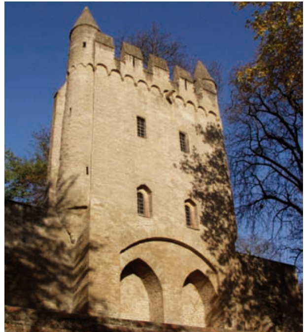
Part of the City Wall/Heidentürmchen

On the south side of the Cathedral stands the centerpoint of the former cloister, the Ölberg . G. Renn, a 19th century sculptor from Speyer, created the figures we see today. The original array of sculpted figures, created from 1505 – 1512, was largely destroyed in 1689 and 1792.