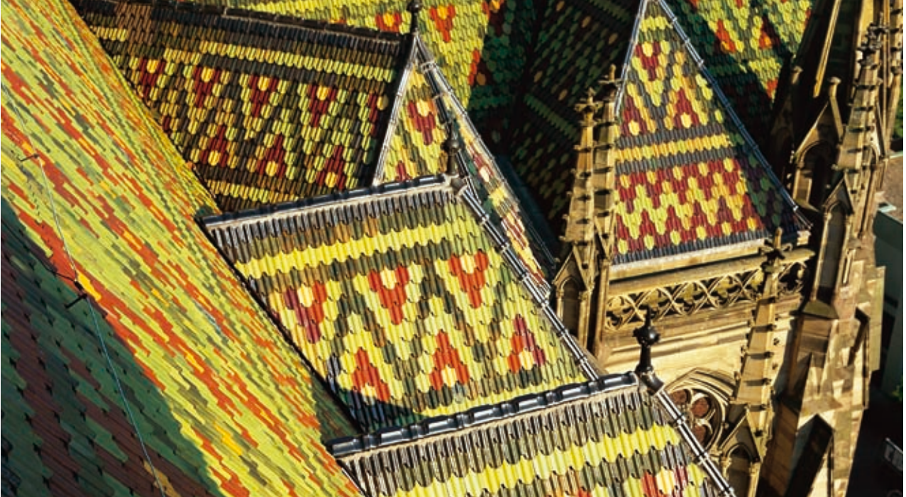
Roof of the Memorial Church/Dach der Gedächtniskirche

panoramic view over the upper Rhine plain between Heidelberg and the German Wine Route (Deutsche Weinstraße). No high-rise disturbs the view over the old houses and streets which, since the Middle Ages, converge in a star pattern on the Cathedral. The majestic Cathedral dominates the countryside between the Odenwald and the Palatinate Forest. Inside the Altpörtel on the second floor, a permanent exhibition has been set up that documents the history of Speyer's fortifications in general and the Old Gate in particular.