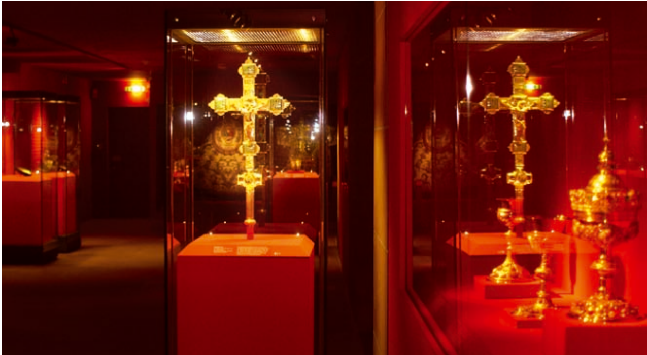
Cathedral Treasure in the Historical Museum/Domschatz im Historischen Museum

panded and connected to the Administration Building (Maximilianstraße No. 5); since 1902, it is an office building. The County Council's conference hall inside – today, it is the conference hall of the city council – is one of the most beautiful neoclassical rooms in Speyer. A few steps further on at No. 21 Kleine Pfaffengasse, we find the Jewish courtyard from the Middle Ages with its synagogue (ruin) and ritual washing bath. In the 1080s, Jews settled here as well as in Old Speyer. Around 1100, the previously destroyed synagogue was rebuilt. Here you will also find the ritual bath (in Hebrew, Mikwe), built in 1128 and the oldest installation of this type in Germany. It features a built-in bathing shaft at 10-meter depth.