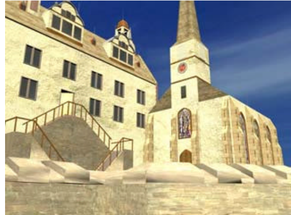
Figure 2: The fortress of Hohenburg

We will build a virtual museum for Homburg and its county, using the existing 3D data and new locations. There are also plans to use 3D graphics and visualisation techniques for an old monastery near our campus, where there was a big romanic church, comparable to Cluny in France. Most parts of this huge monastery, where the children of the german emperors were educated thousand years ago, was destroyed during the french revolution.