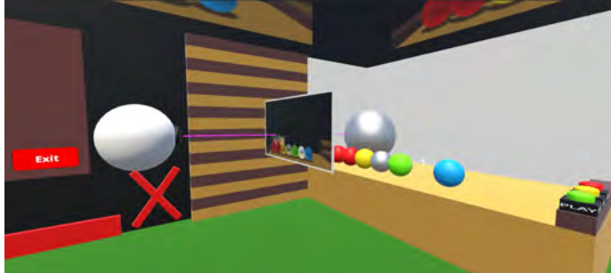
Figure 2: The elements of a raytracer in an immersive environment

We implemented the immersive learning application Visual Raytrace [Sä21a, Sä21b] using the Unity Game Engine and HTC Vive Input Utility [Won21]. The application runs on HTC Vive Pro and Vive Focus Plus. Figure 2 shows the main features of the application. The scene to be rendered is placed in the virtual environment as a world in a miniature [SCP95].